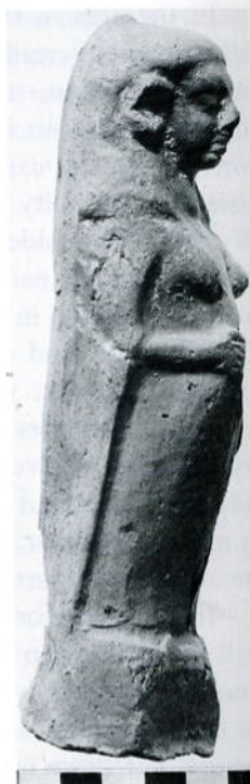
Fig. 2 (left). Locus No 228 in Area B, where the clay figurines have been found. Fig. 3 (right). Eastern figurine of female deity.

2. The Western group of area B favissa included the head of a Greek warrior. This is a solid clay head, moulded in front and smooth at the back, representing a bearded male wearing a Greek helmet. The style is quite archaic and something of the well-known «archaic smile» can be detected. There were also fragments of four figurines depicting women. All are hollow figurines, moulded in front and smooth at the back, and all belong to the fertility goddess type, usually found naked or dressed in a Greek chiton , a garment which does not cover the entire body. A few of these figurines are purely Greek in style; the clothing of the others is Greek but the figure Eastern. They appear in the three familiar gestures: holding their breasts, pregnant or nursing a child. More interesting is the smaller figurine of a naked woman with a swollen belly and drooping breasts, seated with legs apart and smiling. To the best of our knowledge, this figurine is unique in favissae of the Persian